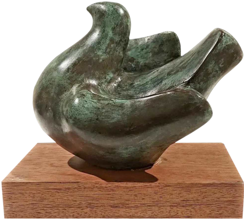
Title: Dove-II, Medium: Bronze, Size: 6 × 7 × 8 inch