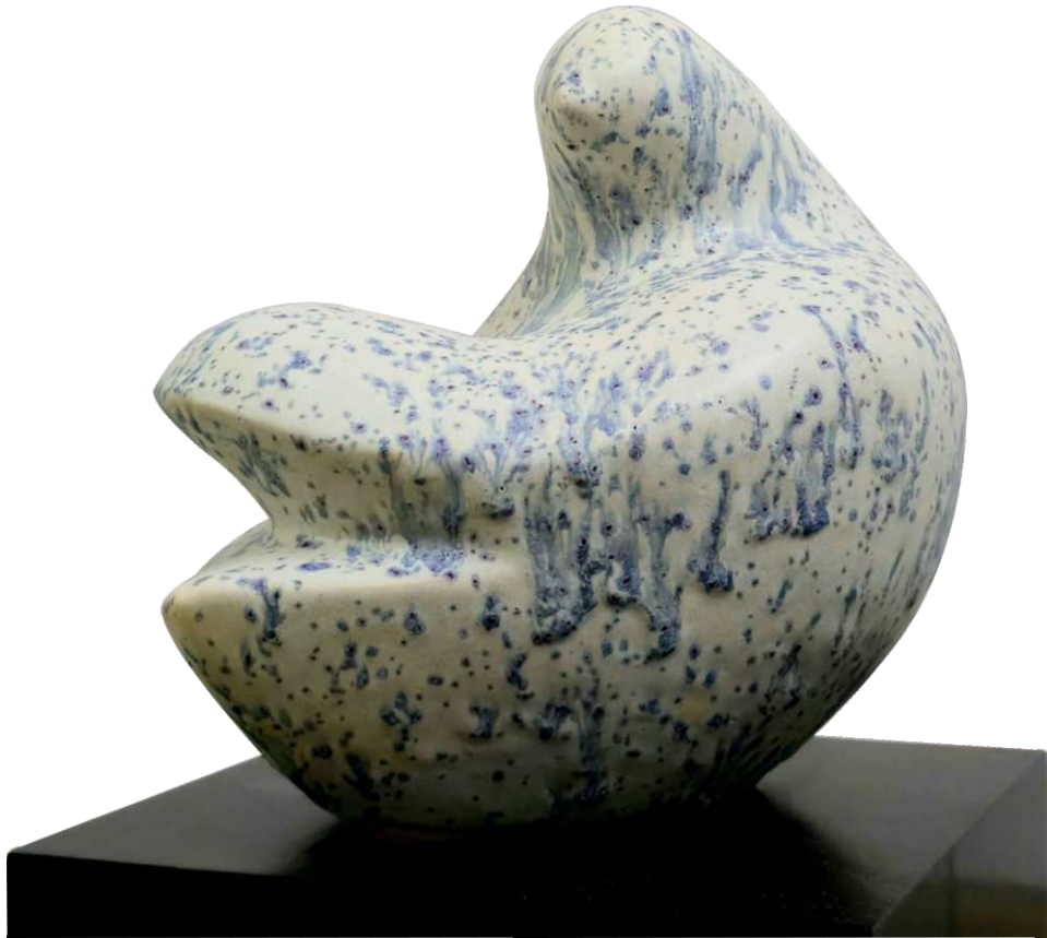
Title: Kapot-I, Medium: Ceramic, Size: 9 × 7 × 8 inch