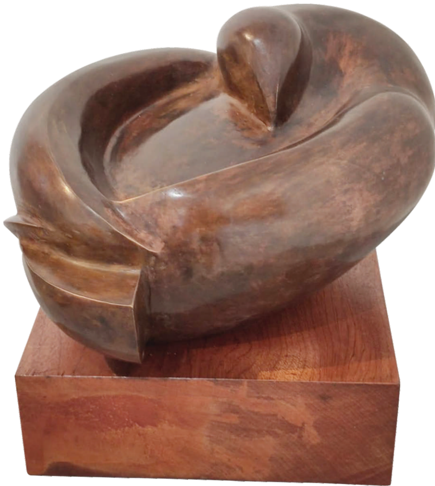
Title: Dove, Medium: Bronze, Size: 11 × 8 × 9 inch