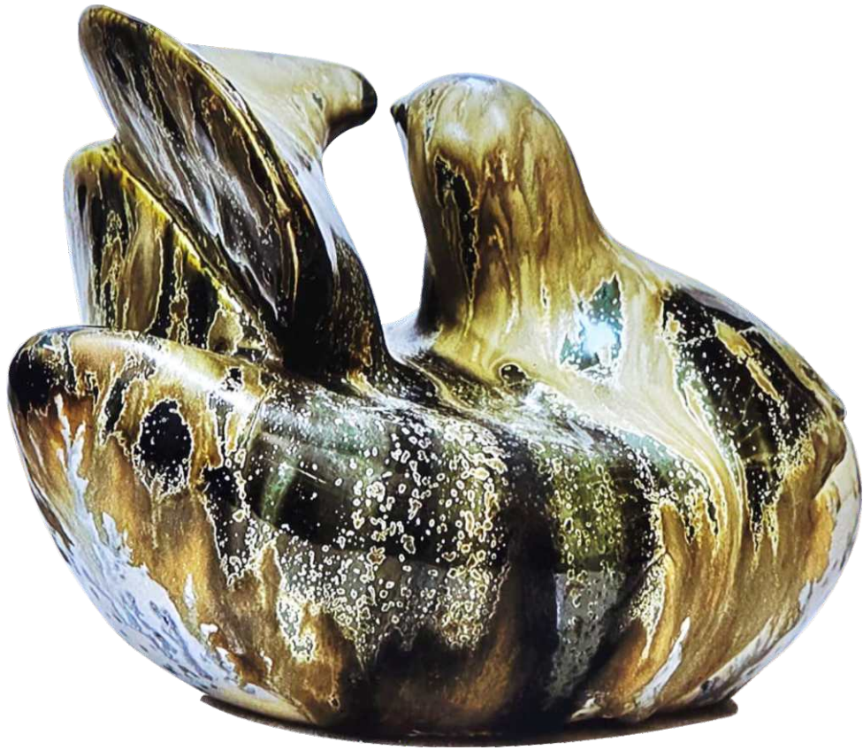
Title: Pigeon-I, Medium: Ceramic, Size: 9 × 7 × 8 inch