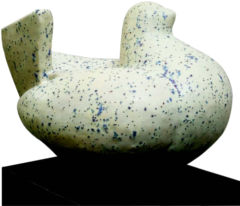
Title: Kapot, Medium: Ceramic, Size: 10 × 7 × 8 inch