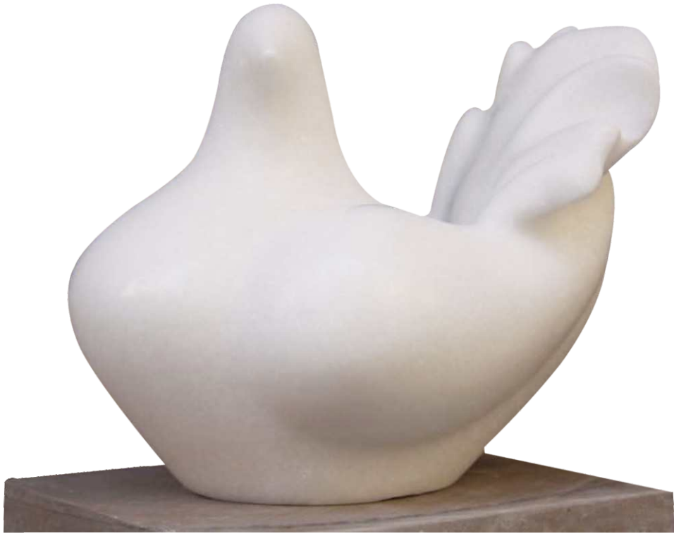
Title: Symbol of Peace, Medium: Stone, Size: 11 x 7 x 8 inch