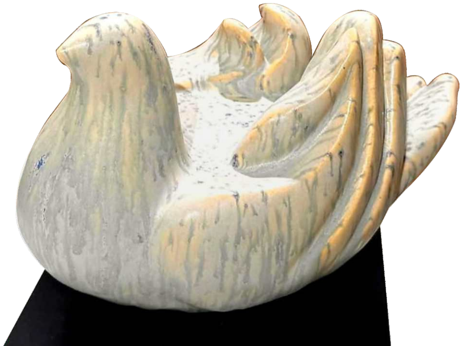
Title: Masakali, Medium: Ceramic, Size: 12 × 7 × 8 inch