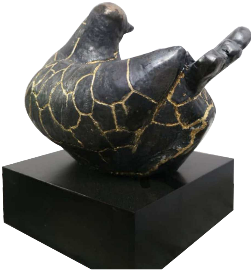
Title: Pigeon, Medium: Ceramic, Size: 10 × 7 × 8 inch