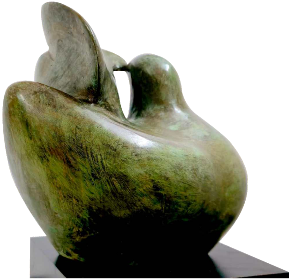
Title: Masakali-I, Medium: Bronze, Size: 10 × 9 × 8 inch