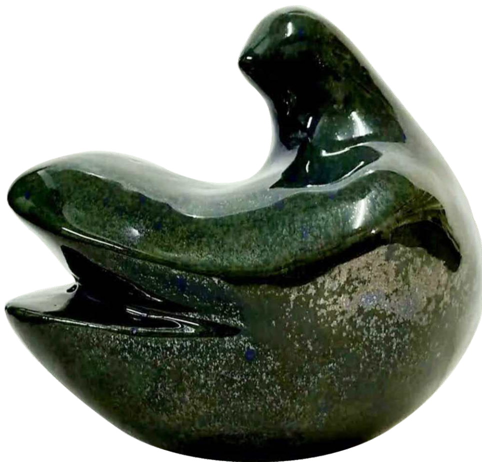
Title: Dove-IV, Medium: Ceramic, Size: 8 × 7 × 6 inch