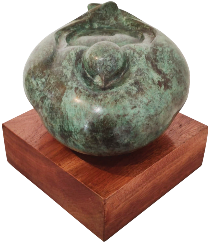
Title: Dove-I, Medium: Bronze, Size: 6 × 7 × 8 inch